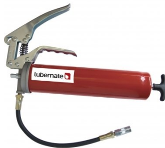
G072 Grease Gun