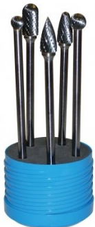
B905 Carbide Burr Double Cut Set - Long Series