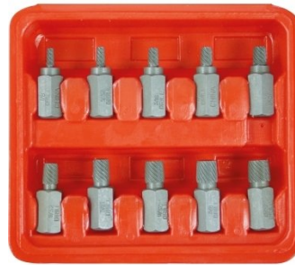
T870 Screw Extractor Set - 10 piece