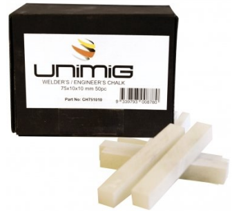
W103 Engineers Chalk Marker- 50 Splits