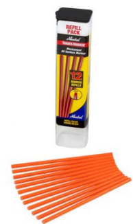
W104A Orange Trades Marker Refills - All Purpose