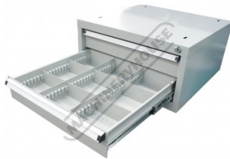
Drawers With Steel Dividers