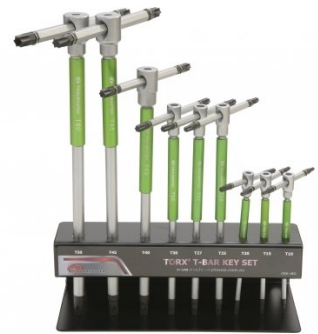
H822 Torx® Key Set with T-Bar Handle