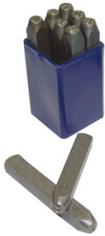
P351 Number Punches