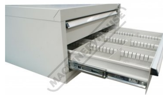
Ball Bearing Slides