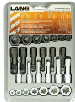
T116 Imperial Thread Restorer Tap & Die Kit - 26 Piece Set