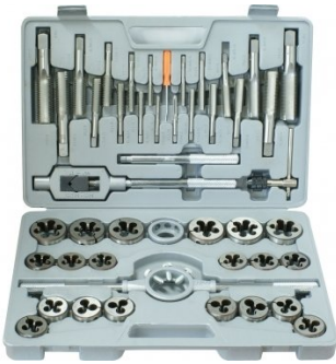
T015 Imperial Alloy Steel Tap & Die Set - 45 Piece