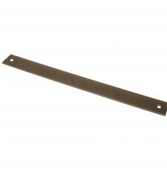
F156 Flexible Body File