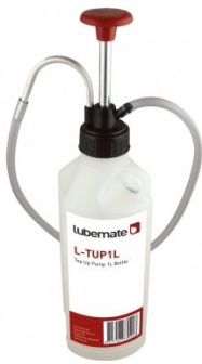
G076 Top Up Pump