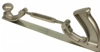
F150 Flexible Body File Holder