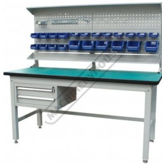
Shown Mounted Under Workbench