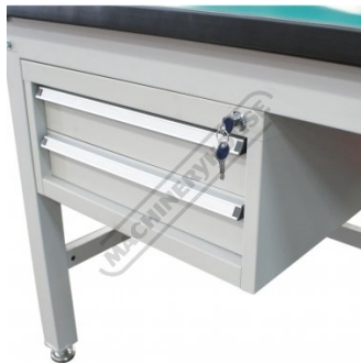
Close Up Shown Mounted Under Work Bench