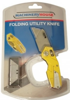
08048 Folding Utility Knife