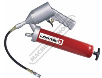
G074 Air Operated Grease Gun