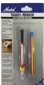
W104 Trades Marker - All Purpose