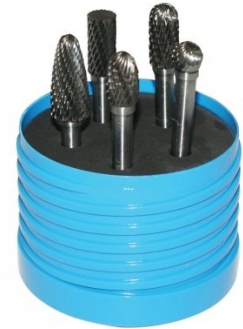
B900 Carbide Burr Double Cut Set - Short Series