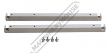
Connecting Rails to Suit A420 Work Bench