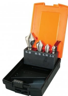
D1051 HSS Countersink Set - 4 Piece