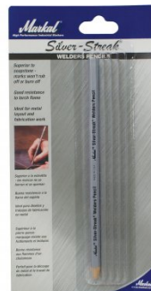
W104B Silver Streak - Welders Pencil