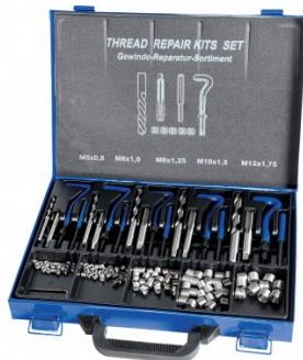
T100 Metric Thread Repair Kit - 130 Piece