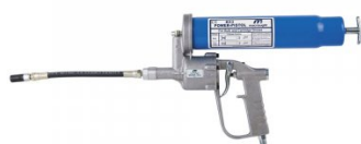
G066 Air Operated Power Pistol - Grease Gun