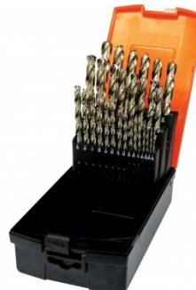
D1282 Imperial Precision HSS Drill Set - 29 Piece