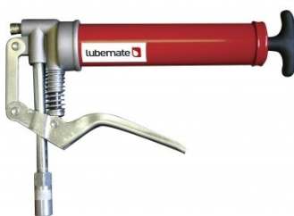
G070 Grease Gun