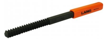
T119 Metric Thread Restorer File