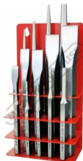
P364 Punch & Cold Chisel Set - 14 Piece