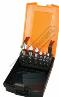
D1061 HSS Countersink Set 6 Piece