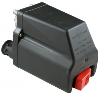
A227 Pressure Switch