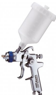
S317 Gravity Feed - Spray Gun