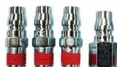
F935 High-Flow Air Fittings