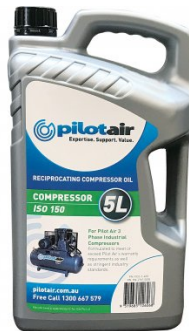
C346 ISO 150 Air Compressor Oil