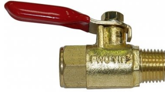
F930 Air Fittings