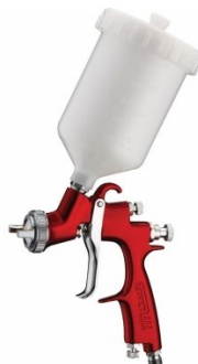
S312 Gravity Feed - Spray Gun