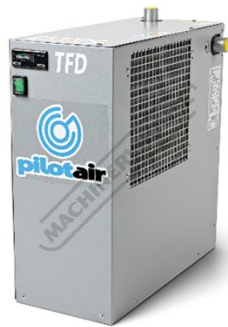
TFD-6 - Refrigerated Compressed Air Dryer