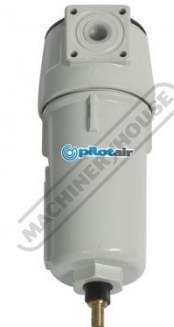
Refrigerated Air Dryer Post Filter