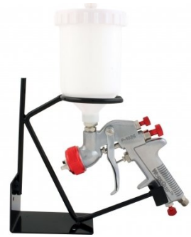
S326 Gravity Feed - Spray Gun