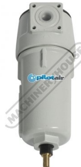
Refrigerated Air Dryer Pre Filter