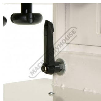
Belt Angle Tilt Lever Lock