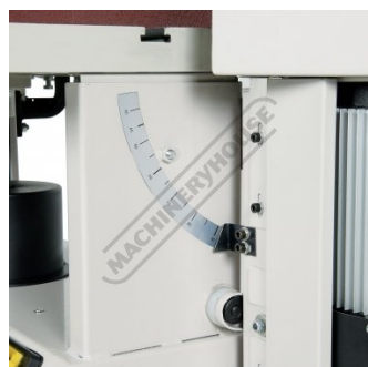
Tilting Table Scale