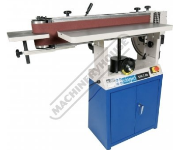
Adjustable Table Height