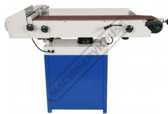
Side View of Belt