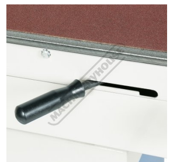
Quick Action Belt Tension Lever