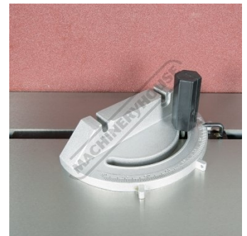
Mitre Guide Scale