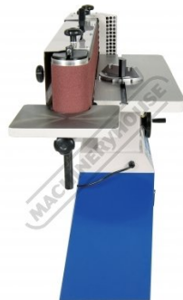
End Table View