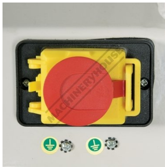
Emergency Stop Switch