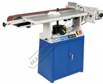
Horizontal Sanding Belt Position