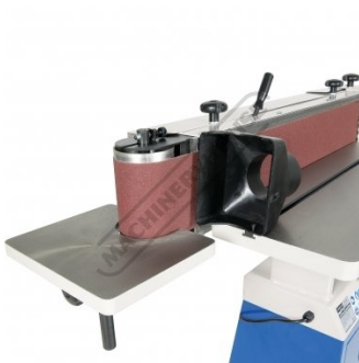
Dust Port for End Table