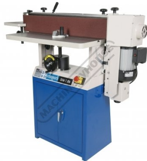
Right Rear View