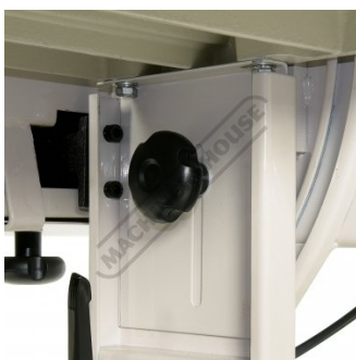
Table Height Locking Knob