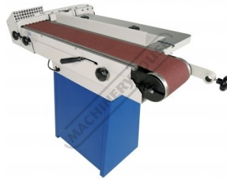
Table Guide Support