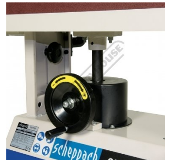
Table Height Adjustment Handle