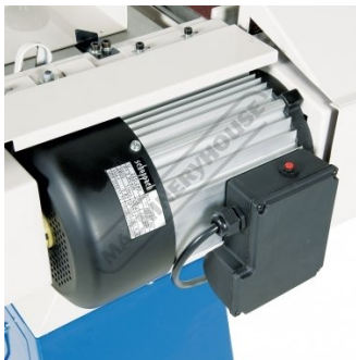
3hp Motor with Thermal Overload