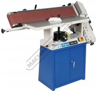
Tilting Sanding Belt 90-180 Degrees