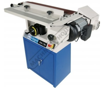
Table Guide Support Rear View