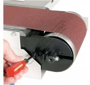
Belt Tracking Adjustment