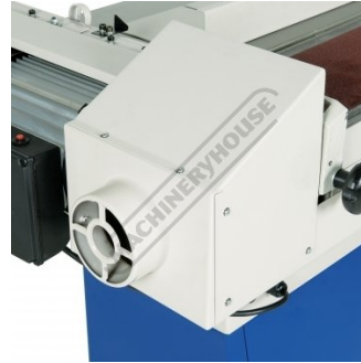
Rear Dust Extraction Port