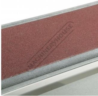
Graphite Belt Pad