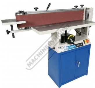
Table Height Lowest Position