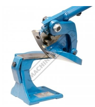
Right View Close Up