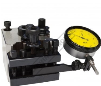
Show With Optional Setup in Lathe Toolholder