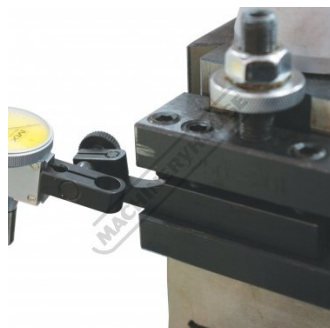
Show with optional indicator-setup in lathe toolholder