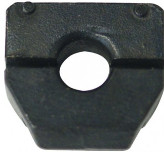
L529 Clamp to Suit Turning Tool Holders