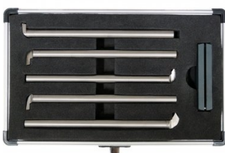
L006A Boring Bar Set - HSS