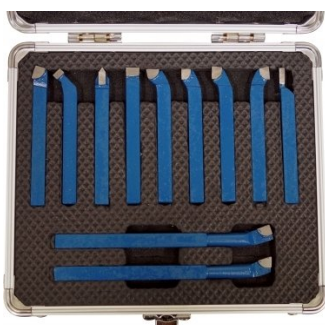
L0085 Carbide Turning Tool Set - 11 piece