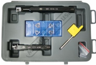
L456 Lathe Threading Tool Kit - Insert Type