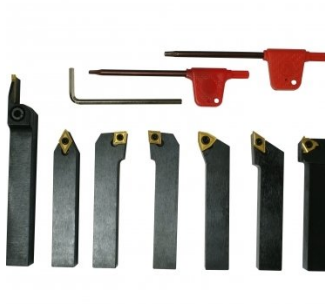
L0099 Lathe Turning Tool Kit - 7 piece Insert Type