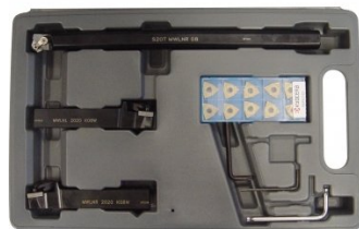
L452 Lathe Turning Tool Kit - 3 piece Insert Type