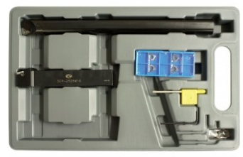
L459 Lathe Threading Tool Kit - Insert Type