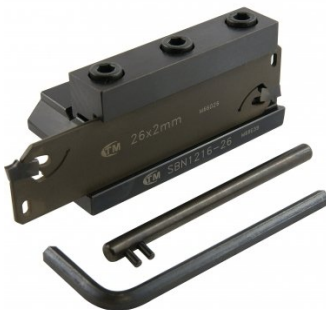
L464 Professional Lathe Parting Tool Kit - Insert Type