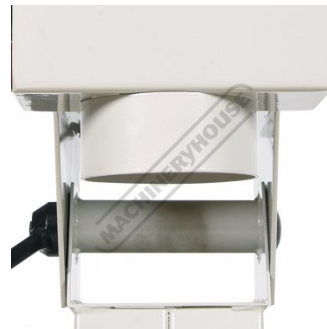
Front 100mm Dust Chute