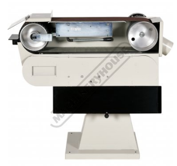
Quick Action Belt Change Lever