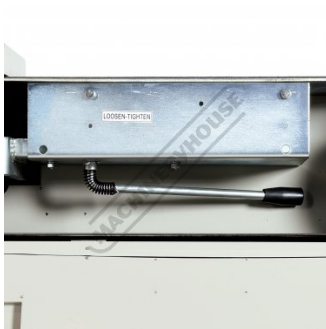
Quick Action Belt Change Lever