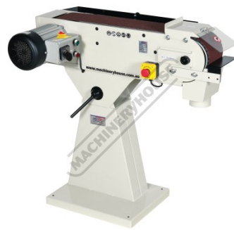
Large 150 x 465mm Working Surface