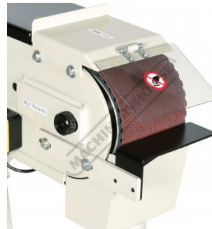
Safety Eye Shield Job Rest