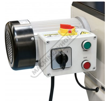
2 Speed Motor and On Off Switch