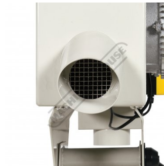
100mm Rear Dust Chute