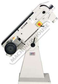
Head Tilting Up