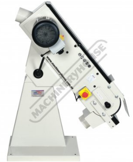
Head Tilting Down