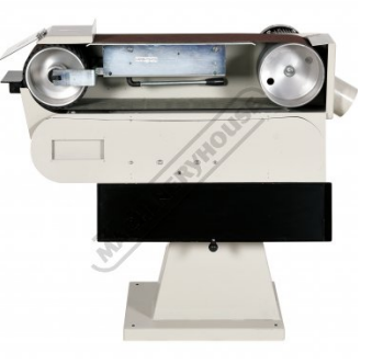
Quick Action Belt Change Lever