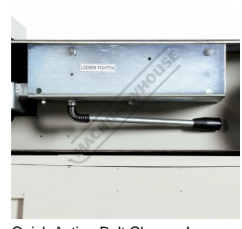
Quick Action Belt Change Lever