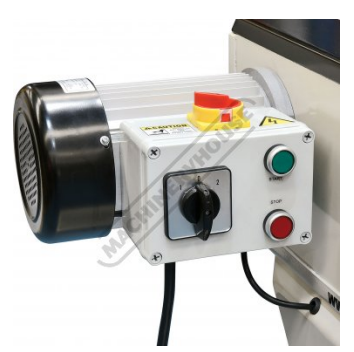
2 Speed Motor and On Off Switch