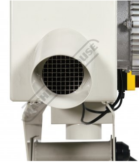
100mm Rear Dust Chute