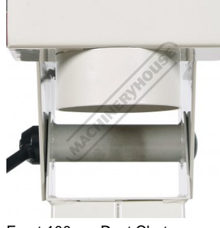
Front 100mm Dust Chute