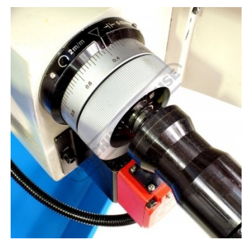
Knee Feed Graduations