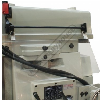
Horizontal Cutting Safety Guards