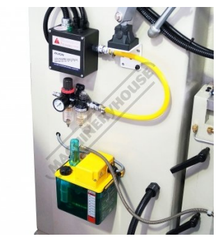
Align Air Operated Draw Bar System Halogen Work Light and Coolant Hose