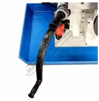
Knee Feed Handle