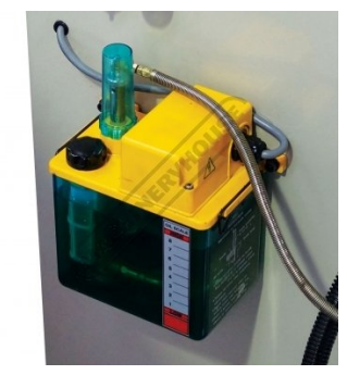
Auto Lubrication System