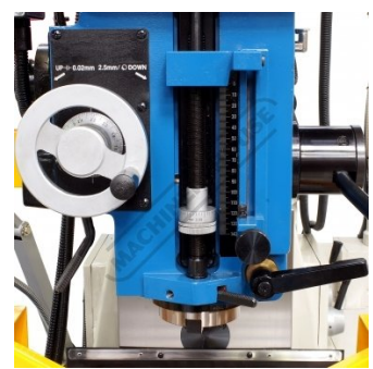
Quill Feed Depth Stop

sales@machineryhouse.com.au www.machineryhouse.com.au