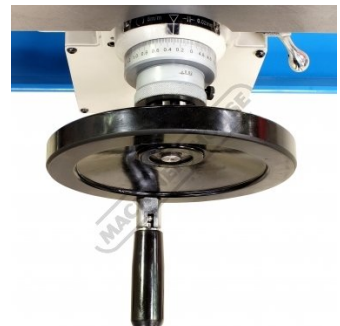
Cross Feed Handle