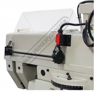
Horizontal Cutting Safety Guards Up Position