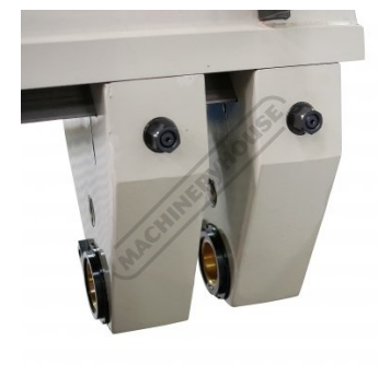
Horizontal Spindle Supports