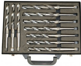
Drills in Case