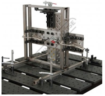
Shown with Optional Accessories Setting Up Frame 2 Shown with Optional Accessories Setting Up Frame 3 Shown with Optional Accessories Setting Up Frame 4 Shown with Optional Accessories Setting Up Frame 5