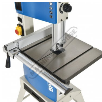
Cast Iron Table with T Slot