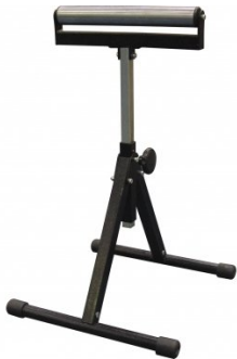
W343A Roller Stand