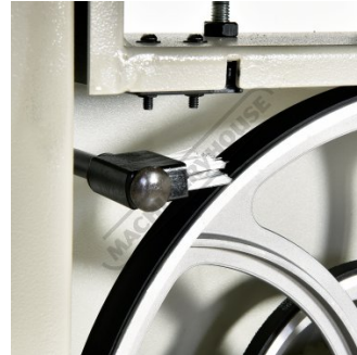
Wheel Cleaning Brush