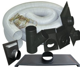
W344 Wood Dust Accessory Kit