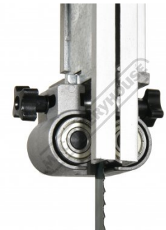
Ball Bearing Blade Guides