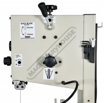
Blade Tension and Tracking Adjustments