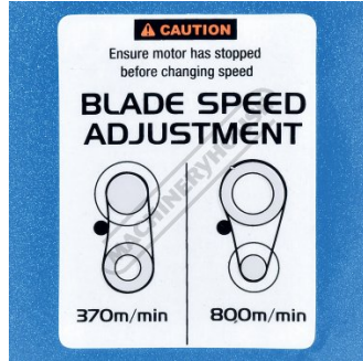
Blade Speed Adjustment