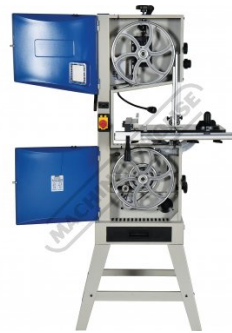
Easy Access for Blade Change