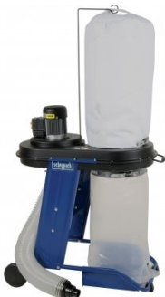
W886 Dust Collector