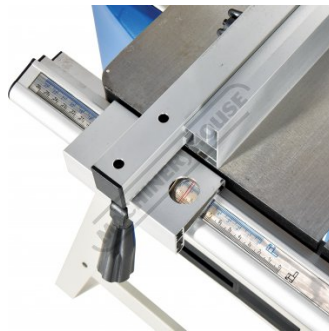
Sliding Rip Fence with High and Low Height Extrusion