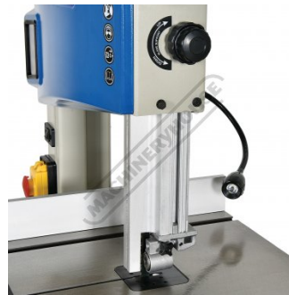
Blade Support Adjustment