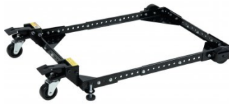
W930 Mobile Base