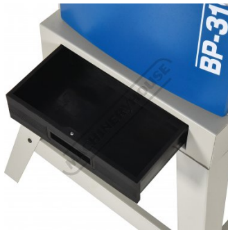
Dust collection Tray