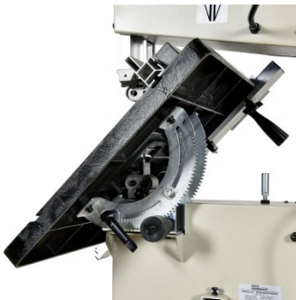
Tilt Table Adjustment