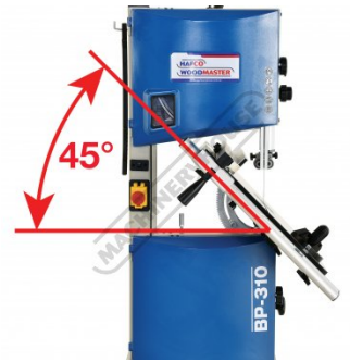
Cast Iron Tilt Table to 45 Degrees