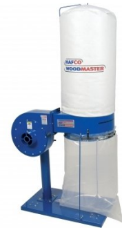
W332 Dust Collector