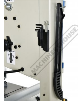
Push Stick and Tools