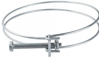
W340 Dust Hose Clamp