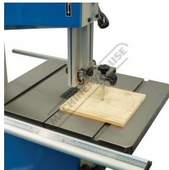
Shown with Optional Circle Cutting Attachment