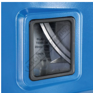
Blade Tension Scale