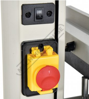
Safety Magnetic Switch and Light Switch