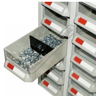
Drawer with Divider Shown with Parts