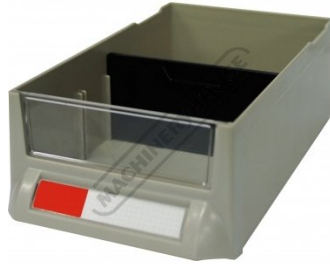
Parts Bin with Clear Window 120 x 218 x 69mm