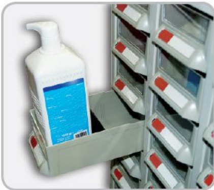
Safety Lip design