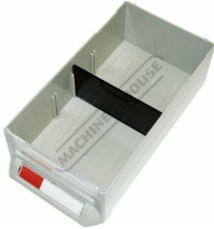
Parts Bin Top View