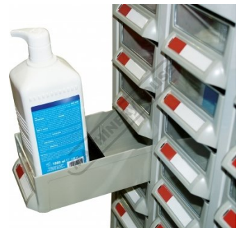
10kg Load With Safety Lip Design