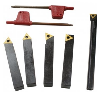
L0055 Lathe Turning Tool Kit - 5 piece Insert Type