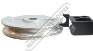
Former & Follower Die Side View