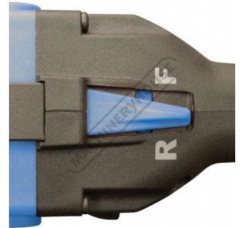
Forward Reverse Switch