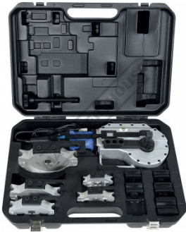
Plastic Carry Case