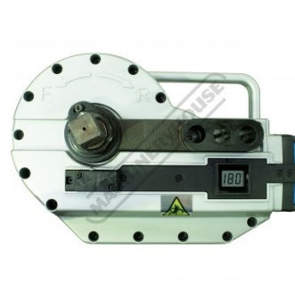
Main Body Top View