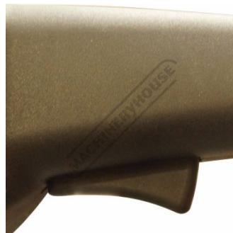
Bending Trigger Switch