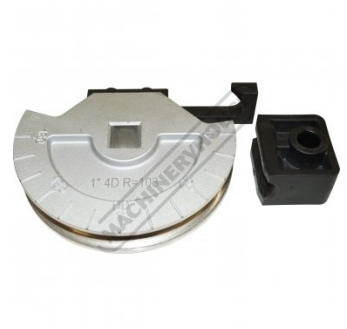
1" Inch Former & Follower Die