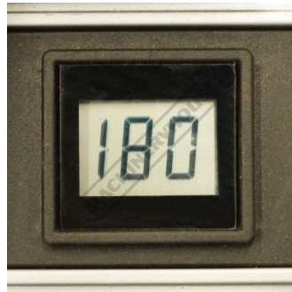
Digital Readout Angle 0~180°