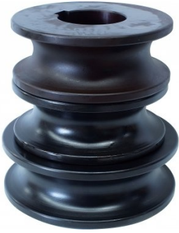
S757H 1-1/4" Pipe (NB) Roll Dies