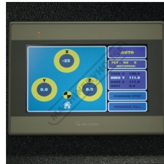
NC Auto Screen