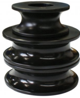
S757I 1-1/2" Pipe (NB) Roll Dies