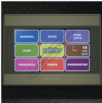
NC Touch Screen Control