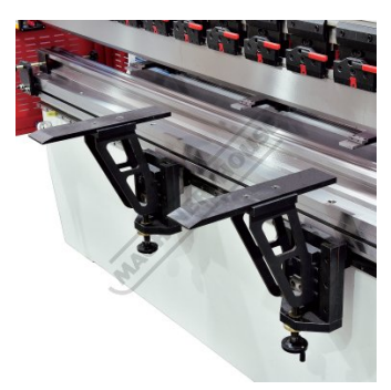
Adjustable Sliding Front Sheet Supports Quick Release Tool Clamps - Change Tools without sliding them all out