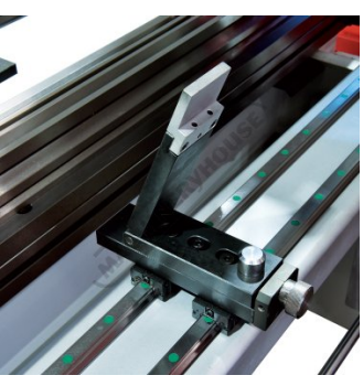
Flip Up Backstop