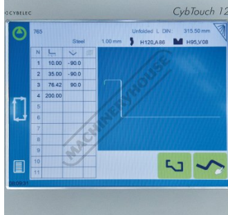
Bend Program List