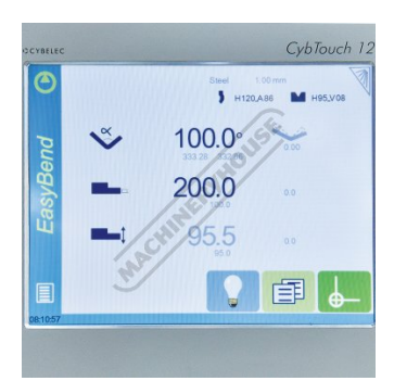
Easy Bend Page