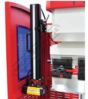
Laser Guarding System with Alignment Guide