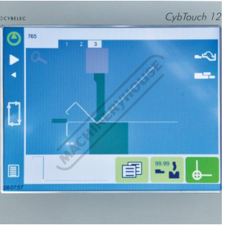
Bend Simulation 2