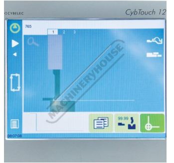
Bend Simulation 1