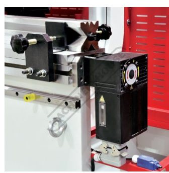
CNC Table Crowning