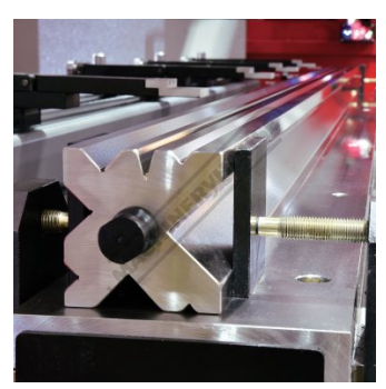
Multi V Die Block

sales@machineryhouse.com.au www.machineryhouse.com.au