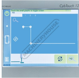
Touch Draw Graphical Programming