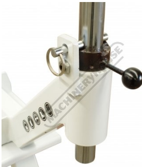
Release Pin for Replacing Formers and Quick Release Handle