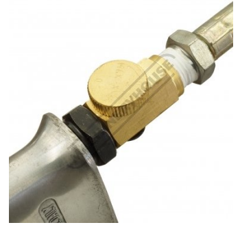
Adjustable Dial 875 to 1350 Blows Per Minute