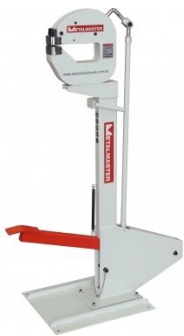
S2266 Foot Operated Shrinker Stretcher - Heavy Duty