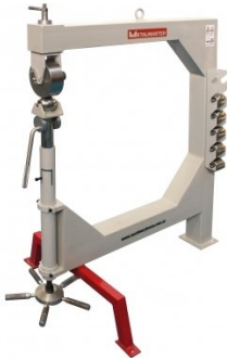
S2257 English Wheel - Heavy Duty