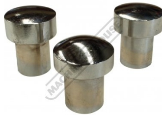
3 x Formers