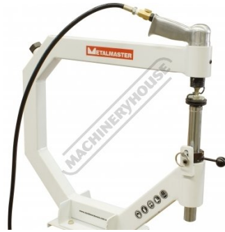
Planishing Work Area