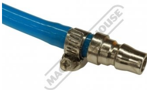
Air In Adaptor