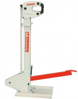
S2264 Foot Operated Shrinker Stretcher - Oval Jaws