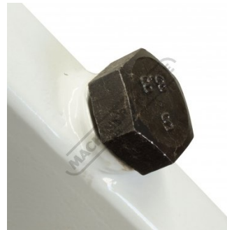
Plug To Fill Frame With Sand