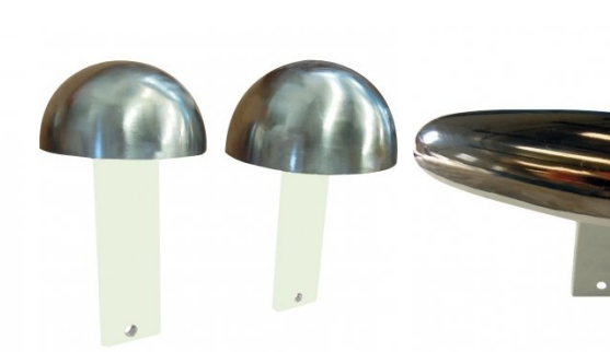
S2237 Bowl Steel Dome Dolly