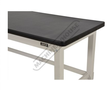
Rounded-bull nosed hard PVC edge Adjustable Feet