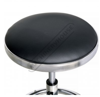
Chrome Plated Heavy Duty Steel Frame High Density Foam Padded Seat