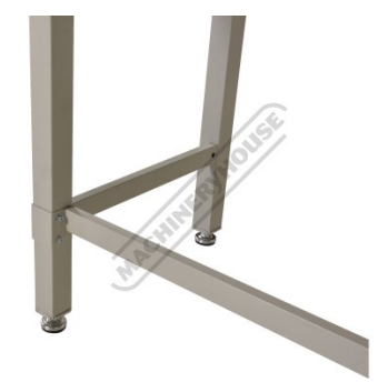
Steel leg bracing