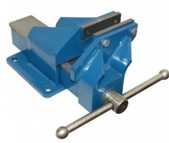
V081 Forge Steel Utility Bench Vice with Anvil & Pipe Jaws