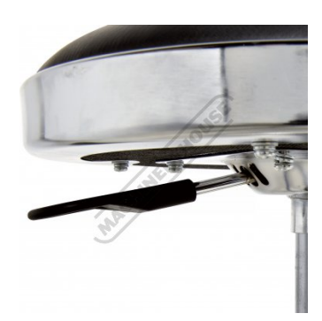
Pneumatic Height Adjustment Lever