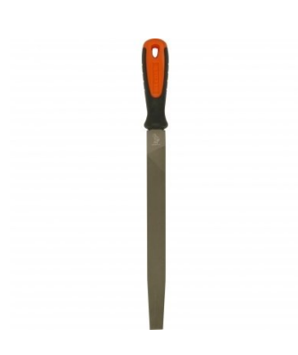
F122 Engineers File, Flat - Smooth Cut