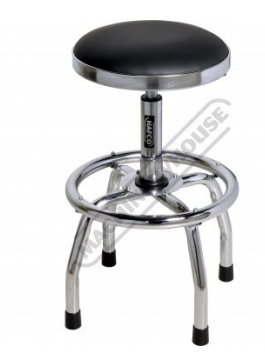
Adjustable Height 675 795mm