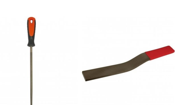
F129 Engineers File, Round - Smooth