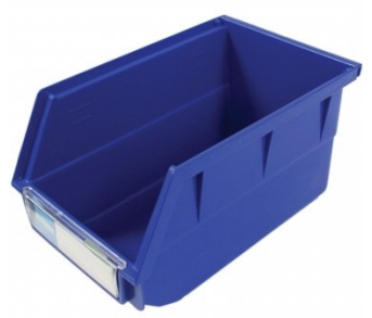
A436 Plastic Bucket