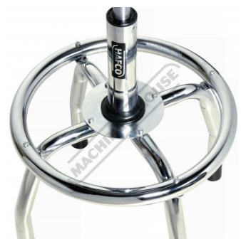
420mm Round Footrest