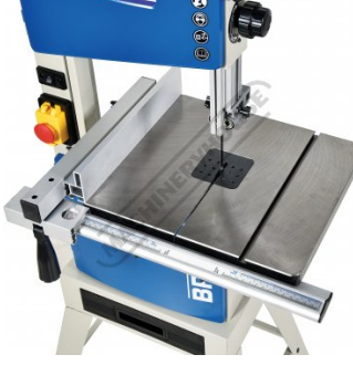
Cast Iron Table with T Slot