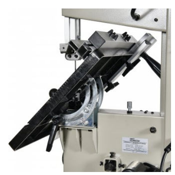
Tilt Table Adjustment