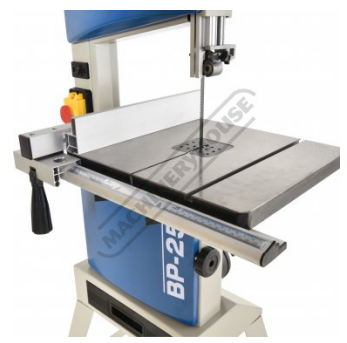
Sliding Rip Fence with High and Low Hieght Extrusion