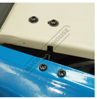
Blade Guard Micro Switch