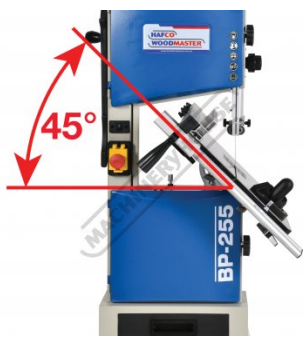
Cast Iron Tilt Table to 45 Degrees