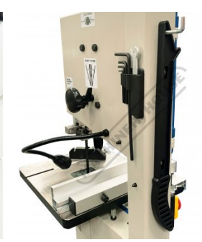
Push Stick and Tools