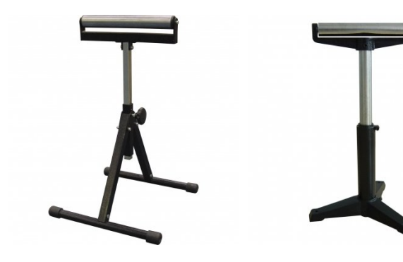
W3434 Roller Stand