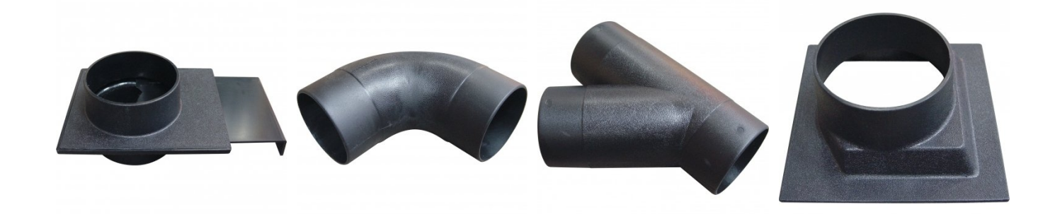
W338 Dust Hose Universal Dust Hood