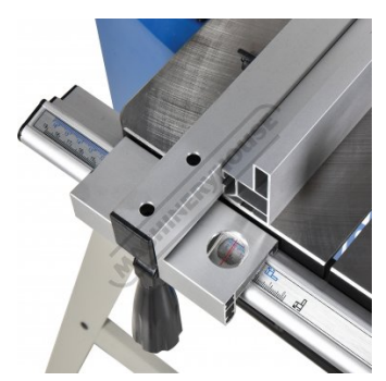
Fence with Quick Action Lock and Sight Glass Blade Support Adjustment