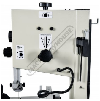
Blade Tension and Tracking Adjustments