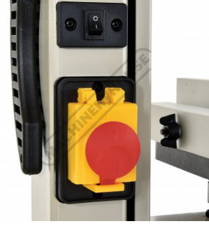
Safety Magnetic Switch and Light Switch 100mm Dust Port and Motor