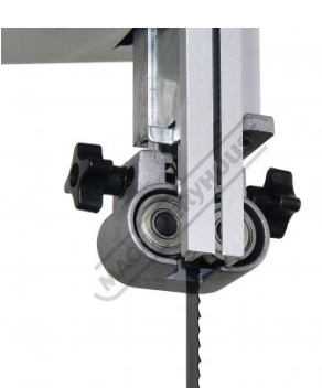
Ball Bearing Blade Guides