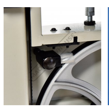
Wheel Cleaning Brush