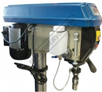
Shown Mounted to Drilling Machine