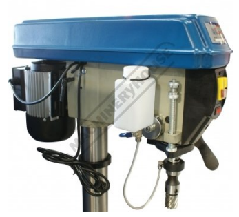
Shown Mounted to Drilling Machine