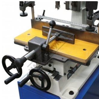
Adjustable Table with Vice Clamps