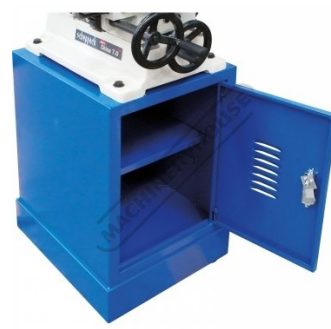
Cabinet Stand with Key Lock