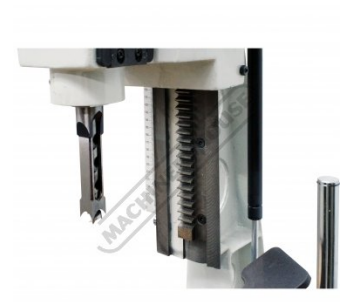
Rack and Pinion Head Movement