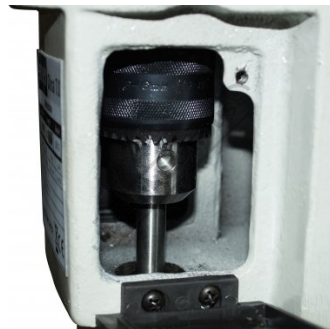
Keyed Chuck for Drill Bit