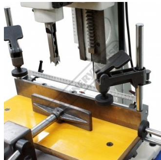
Overhead Material Clamps