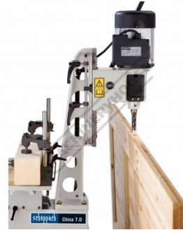
Head Reversed for Door Locks