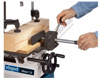
Cam Lever Vice Clamping