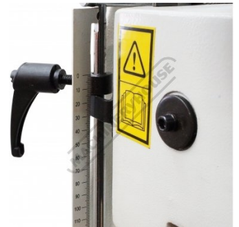
Mortise Head Depth Stop Gauge