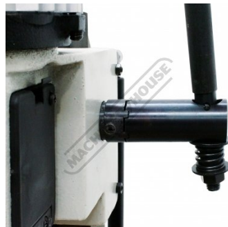
Handle Repositioning via Drive Dog System