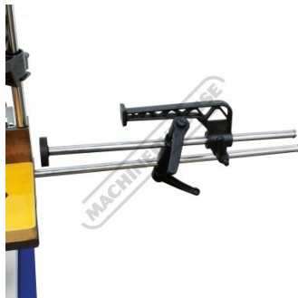
Adjustable Length Stop