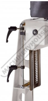
Dovetail Vertical Head Slide