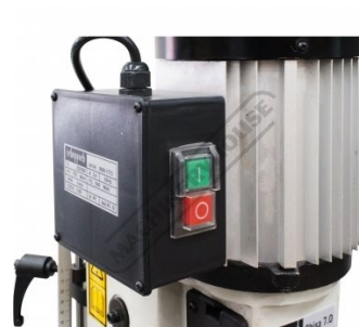
Magnetic Safety Switch