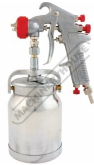
S325 Suction Spray Gun & Pot