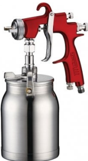
S320 Suction Spray Gun & Pot