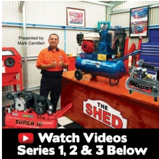
Intro, Selecting & Installing Compressors