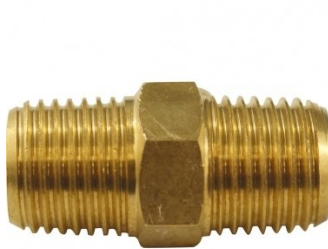
F860 Air Fittings