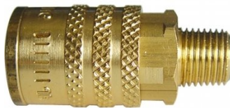
F901 Air Fittings