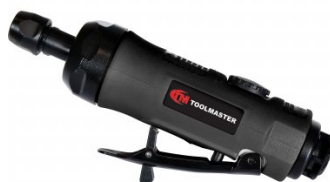
A040 Air Die Grinder