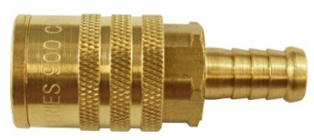
F912 Air Fittings