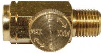
A219 Air Fittings