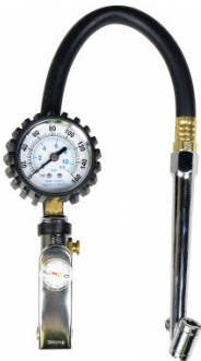
A259 Tyre Inflator with Dial Gauge