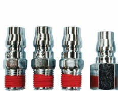
F935 High-Flow Air Fittings