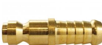
F906A Air Fittings