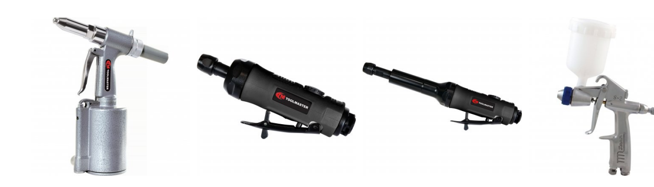
S322 Gravity Feed - Spray Gun

Sydney: (02) 9890 9111 Brisbane: (07) 3715 2200 Melbourne: (03) 9212 4422 Perth: (08) 9373 9999