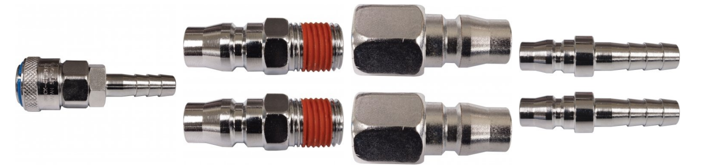
F955 High-Flow Air Fittings