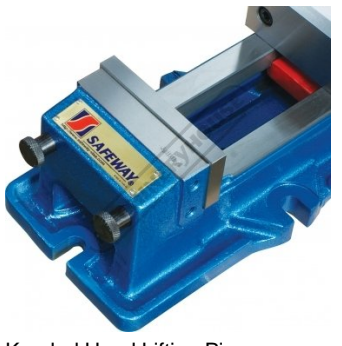
Knurled Head Lifting Pins