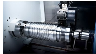
Puma 2600 Large Shaft