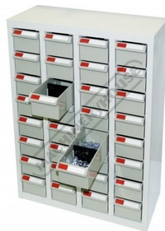
Top View Shown with Parts