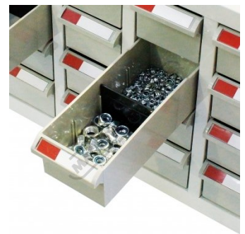
Drawer with Divider Shown with Parts