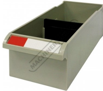
Parts Bin 90 x 218 x 70mm