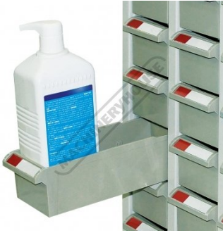
10kg Load With Safety Lip Design