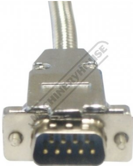
DSub9 Male Plug