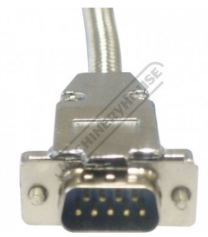
DSub9 Male Plug