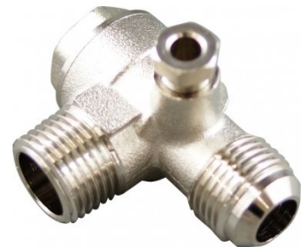
A230A Air Fittings