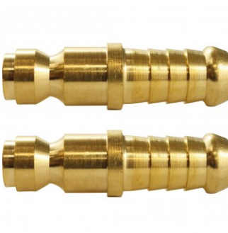
F906A Air Fittings