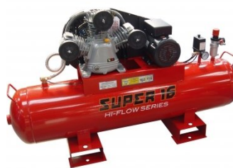
C345 Air Compressor