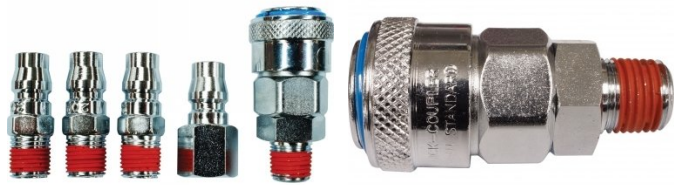
F941 High-Flow One Touch System Air Fittings