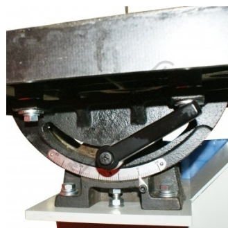
Table Tilt Adjustment