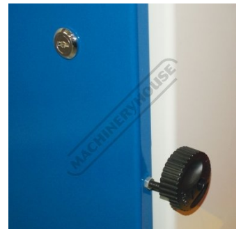
Key Lockable Blade Doors