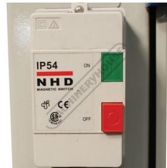
Magnetic Safety Switch