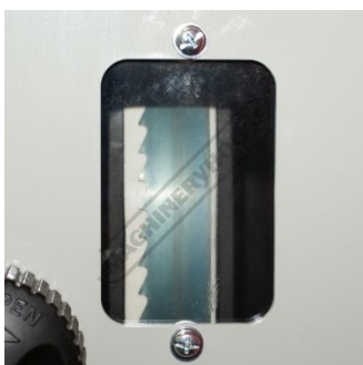
Viewing Window for Blade Alignment