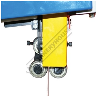
Ball Bearing Blade Guides