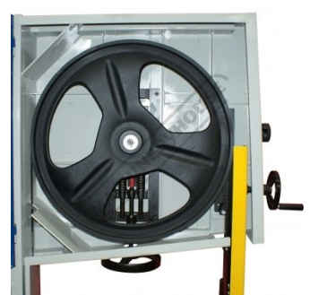
Cast Iron Blade Wheels