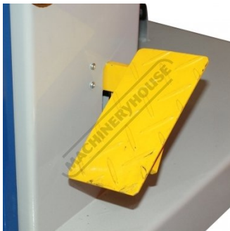
Foot Brake Lever