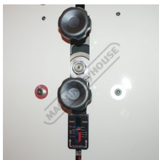
Blade Width Tension Indicator