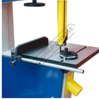
Table with Sliding Rip Fence