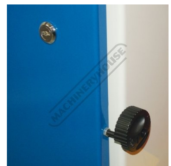
Key Lockable Blade Doors