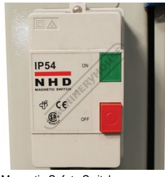
Magnetic Safety Switch