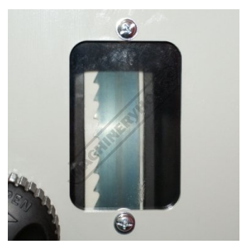
Viewing Window for Blade Alignment Blade Width Tension Indicator