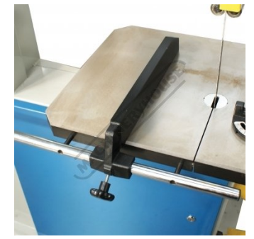
Sliding Rip Fence