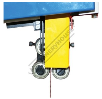
Ball Bearing Blade Guides