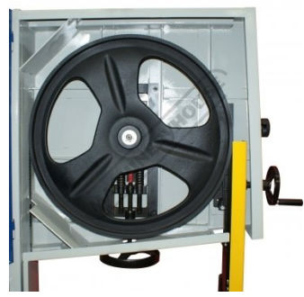
Cast Iron Blade Wheels