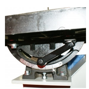
Table Tilt Adjustment