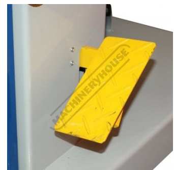
Foot Brake Lever