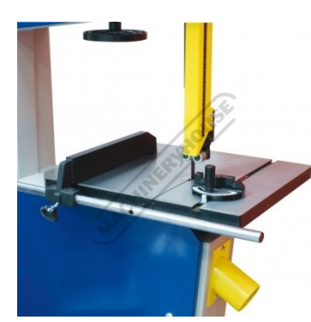
Table with Sliding Rip Fence