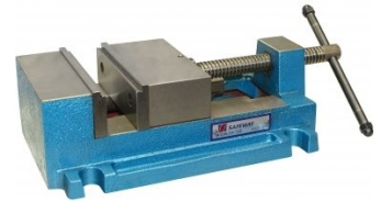
V142 Safeway Precision Drill Press Vice