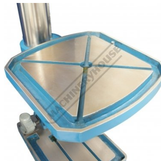
T Slotted Work Table