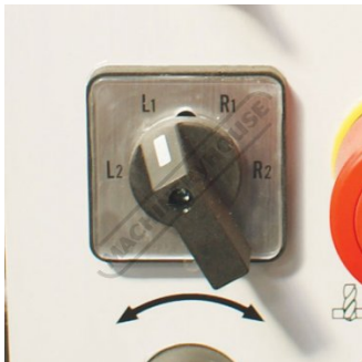
High Low with Forward and Reverse Switch