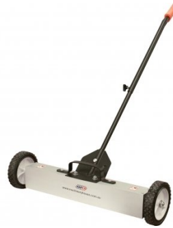
M9991 Magnetic Floor Sweeper