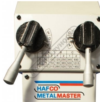
Gear Selection Levers