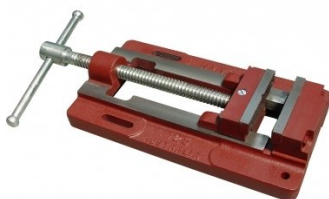
V138 Drill Press Vice