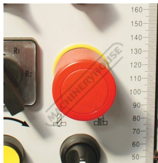
Emergency Stop Switch and Overload Protection