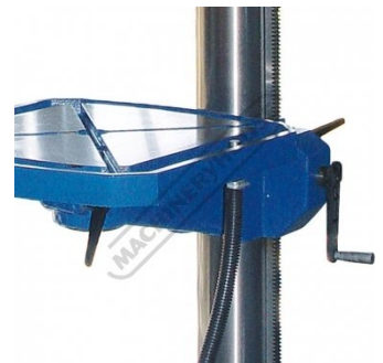
Rack and pinion wind up Table