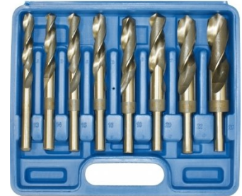
D1171 Metric Industrial HSS Reduced Shank Drill Set