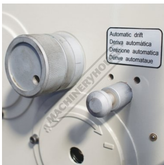
Automatic Feed Range and Auto Drift Drill Ejector