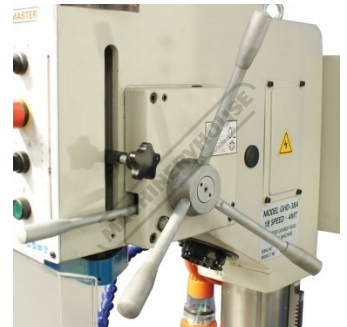
Adjustable accurate depth setting with auto feed out for increased productivity