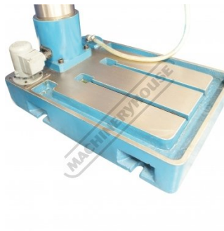
T Slotted Base