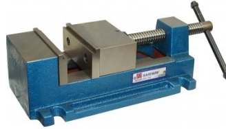
V141 Safeway Precision Drill Press Vice