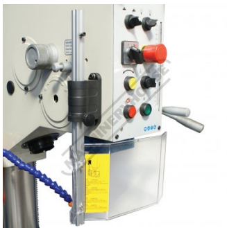
Chuck Guard with Micro Switch