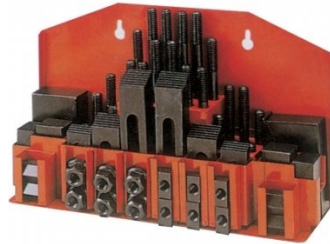
C096A Clamp Kit 58 piece - Industrial Series