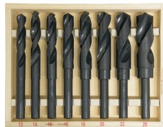
D117 Metric HSS Reduced Shank Drill Set