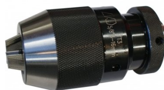
C294 Industrial Drill Chuck - Keyless Type