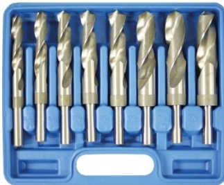
D1181 Imperial Industrial HSS Reduced Shank Drill Set