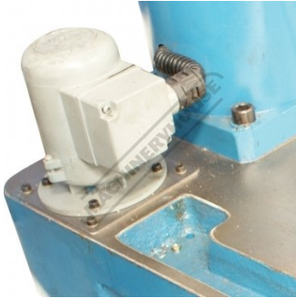
Coolant Pump System