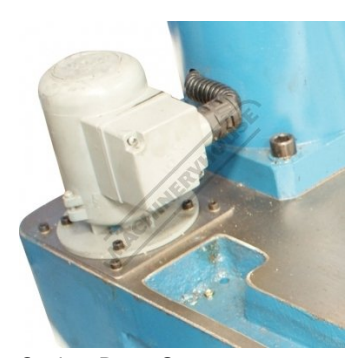
Coolant Pump System

sales@machineryhouse.com.au www.machineryhouse.com.au