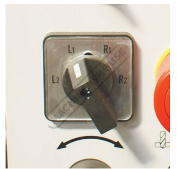
High Low with Forward and Reverse Switch