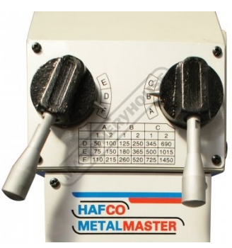
Gear Selection Levers