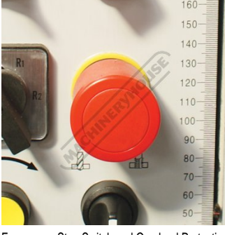
Emergency Stop Switch and Overload Protection Work Light