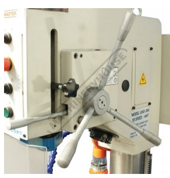
Adjustable accurate depth setting with auto feed cut out for increased productivity