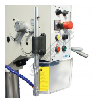
Chuck Guard with Micro Switch