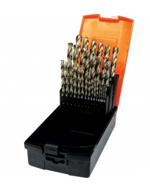
Metric Precision HSS Drill Set - 25 Piece

Imperial Precision HSS Drill Set - 29 Piece