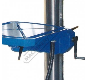
Rack and pinion wind up Table