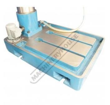
T Slotted Base