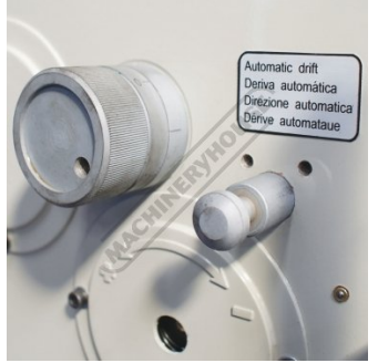
Automatic Feed Range and Auto Drift Drill Ejector Head Controls