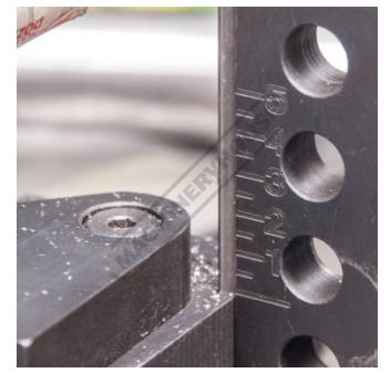
Height Setting Scale