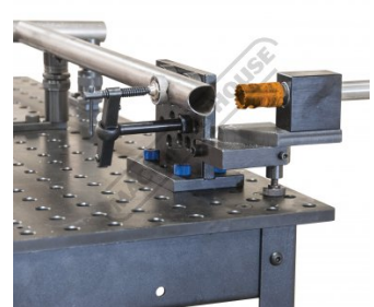
Shown Set Up In Use with Optional Accessories Shown Set Up with Optional Accessories Angle Setting Scale