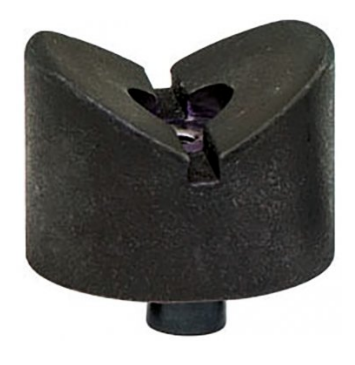
W08042 BuildPro Ball Lock Bolt