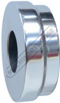
Lower Forming Die