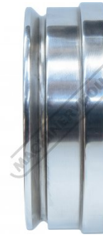
Lower Edge Forming Die Side View