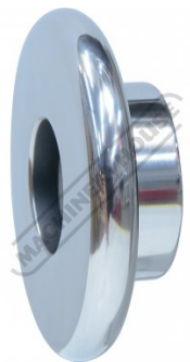
3/8 inch Tipping Die