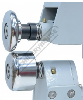
Round Tipping Die with 1 2 Inch Tipping Die