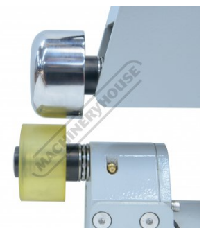
Polyurethane Lower Wheel with Round Tipping Die Side View