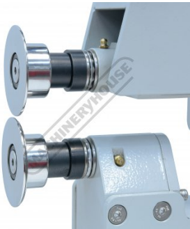
Inside Offset Die with Knife Edge Tipping Die

sales@machineryhouse.com.au www.machineryhouse.com.au