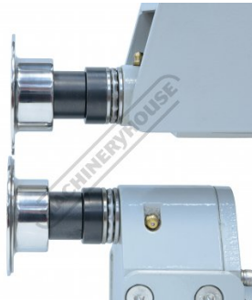
Inside Offset Die with Knife Edge Tipping Die Side View