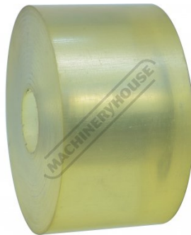
Polyurethane Lower Wheel