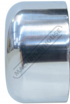
Round Tipping Die Side View