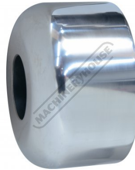
Round Tipping Die