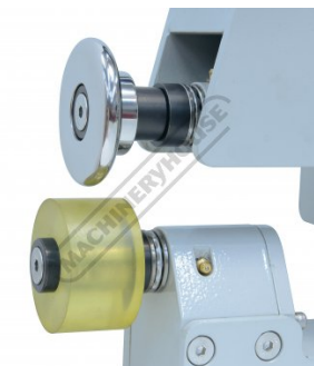
Polyurethane Lower Wheel with 3 8 Inch Tipping Die