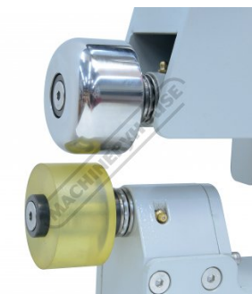
Polyurethane Lower Wheel with Round Tipping Die