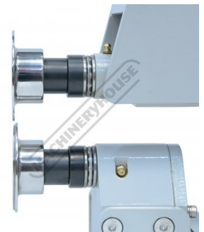
Outside Offset Die with Knife Edge Tipping Die Side View