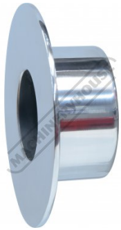
Knife Edge Tipping Die