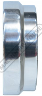
Lower Forming Die Side View