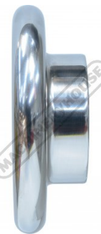
3/8 inch Tipping Die Side View