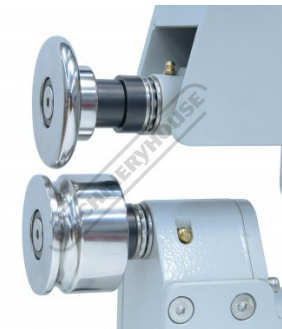
180 Degree Lower Die with 3 8 Inch Tipping Die