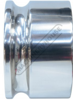
180 Degree Lower Die Side View