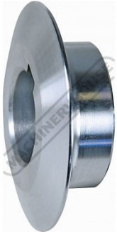
Art Wheel Die

sales@machineryhouse.com.au www.machineryhouse.com.au