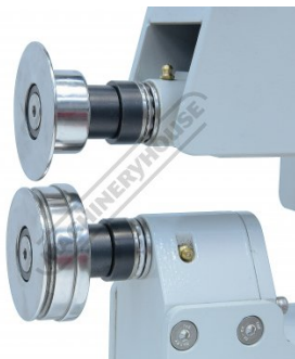
Lower Edge Forming Die with Knife Edge Tipping Die