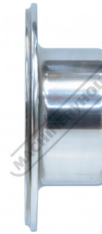
Outside Offset Die Side View