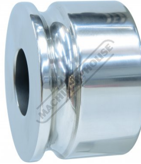
180 Degree Lower Die