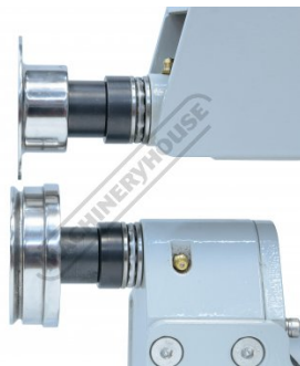
Lower Edge Forming Die with Knife Edge Tipping Die Side View