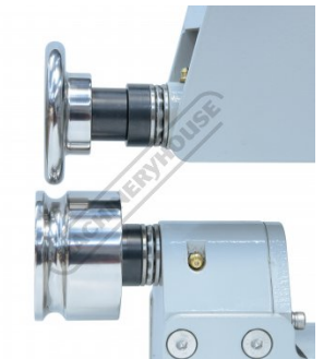
180 Degree Lower Die with 3 8 Inch Tipping Die Side View