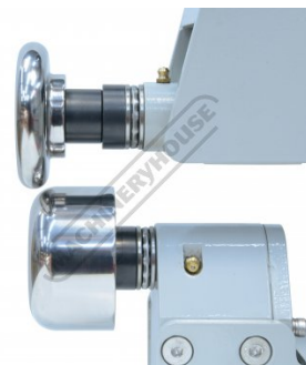
Round Tipping Die with 1 2 Inch Tipping Die Side View