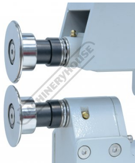
Inside Offset Die with Outside Offset Die