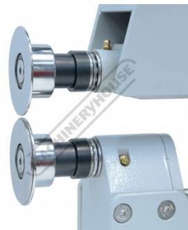
Outside Offset Die with Knife Edge Tipping Die