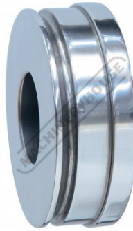
Lower Edge Forming Die