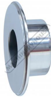
Outside Offset Die