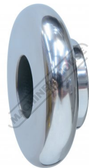
1/2 inch Tipping Die