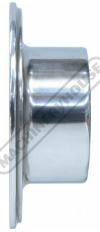
Inside Offset Die Side View