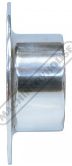
Knife Edge Tipping Die Side View