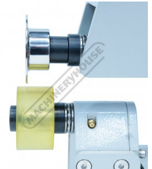
Polyurethane Lower Wheel with Knife Edge Tipping Die Side View