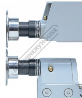
Inside Offset Die with Outside Offset Die Side View