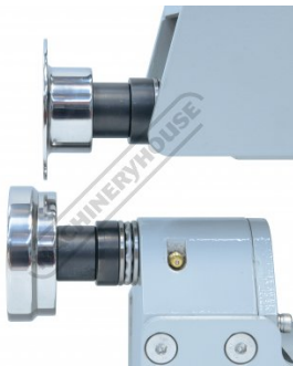
Lower Forming Die with Knife Edg Tipping Die Side View