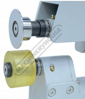
Polyurethane Lower Wheel with Knife Edge Tipping Die