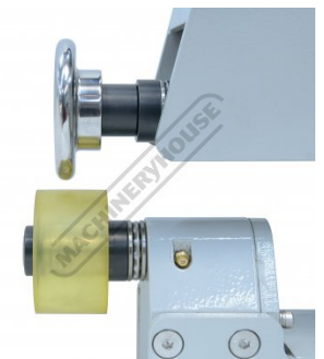
Polyurethane Lower Wheel with 3 8 Inch Tipping Die Side View