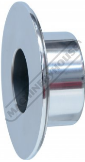
Inside Offset Die