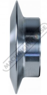
Art Wheel Die Side View