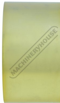
Polyurethane Lower Wheel Side View