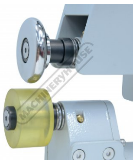
Polyurethane Lower Wheel with 1 2 Inch Tipping Die