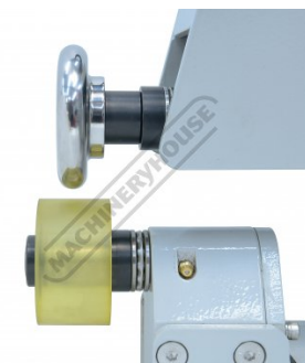
Polyurethane Lower Wheel with 1 2 Inch Tipping Die Side View