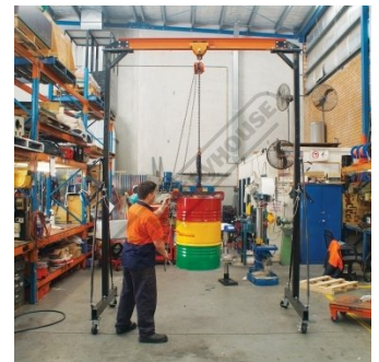
Shown Lifting Oil Drum