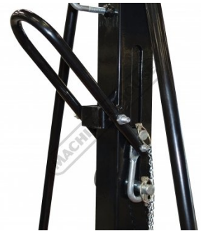
Safety Height Locking Pins