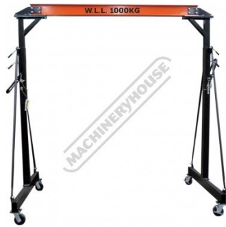
Mobile Girder Rail