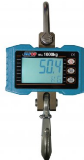
C191 Digital Crane Scale