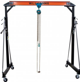
K088 Mobile Girder Rail Gantry Package Deal