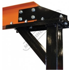
Heavy Duty Frame Beam Support