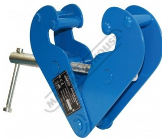
Includes 1T Girder Clamp