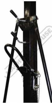
Lever Action Beam Height Adjustment