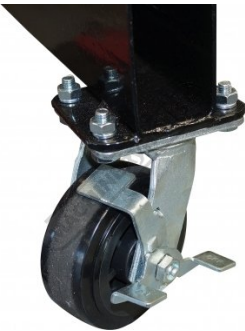
Swivel Wheels with Lock