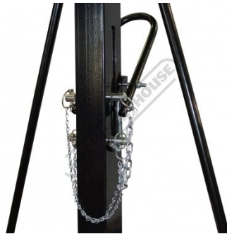
Support Pin Safety Chain with Lynch Pin Clips