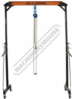
Shown at Full Height