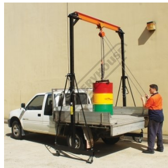
Shown Loading Oil Drum onto Ute