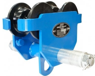
C147 Girder Trolley