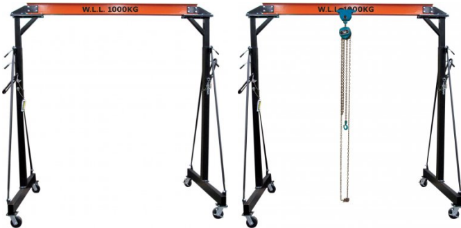
K088 Mobile Girder Rail Gantry Package Deal