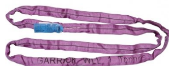
H308 Round Sling