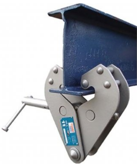
C175 Girder Clamp