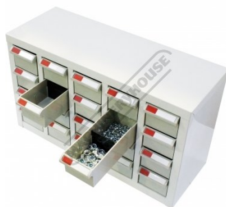
Top View Shown with Parts