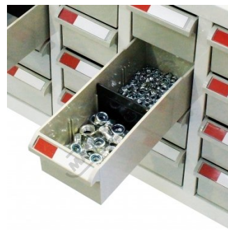
Drawer with Divider Shown with Parts