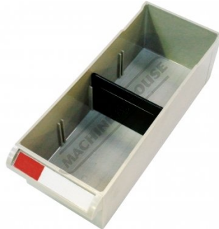
Parts Bin Top View