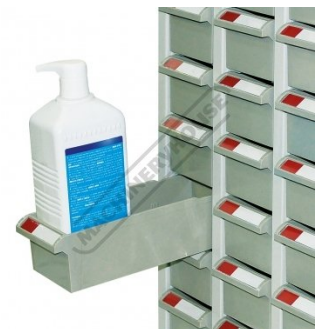
10kg Load With Safety Lip Design