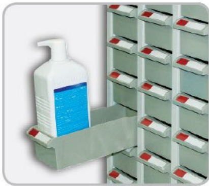
Safety Lip design