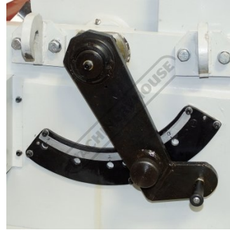
Rapid Blade Adjustment For Material Thickness