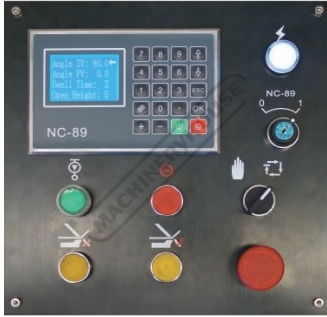
NC 89 Control Panel