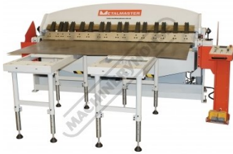
Shown with Optional Ball Transfer Tables - Order Code (L840)