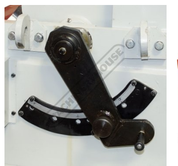
Rapid Blade Adjustment For Material Thickness F