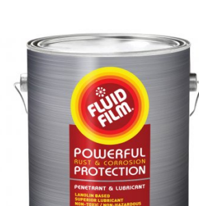
O040 Rust & Corrosion Preventive -Penetrant & Lubrication

Rust & Corrosion Preventive -Penetrant & Lubrication