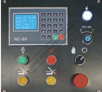
NC 89 Control Panel