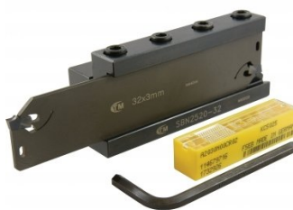
L467 Professional Lathe Parting Tool Kit - Insert Type