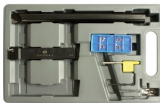
L459 Lathe Threading Tool Kit - Insert Type