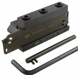
L464 Professional Lathe Parting Tool Kit - Insert Type