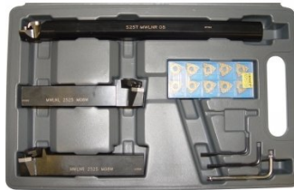
L453 Lathe Turning Tool Kit - 3 piece Insert Type