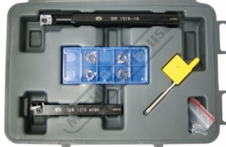
L456 Lathe Threading Tool Kit - Insert Type