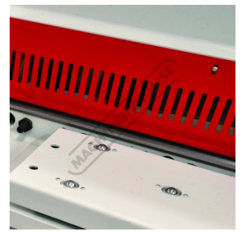
Ball transfer table