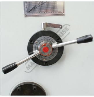
Rapid blade clearance adjustment