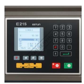
Estun E21S controller