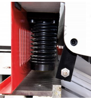
Hydraulic material hold downs