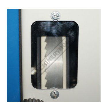
Blade View Window