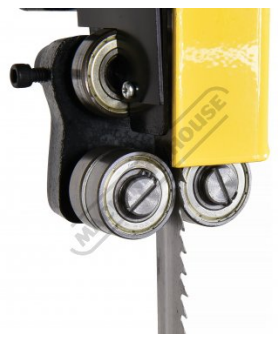
Ball Bearing Blade Guide