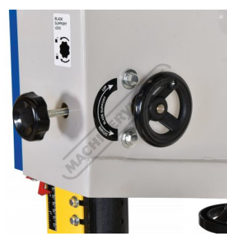
Blade Height Adjustment-Lock