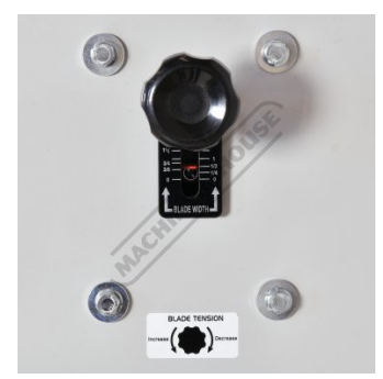
Blade Width And Tension