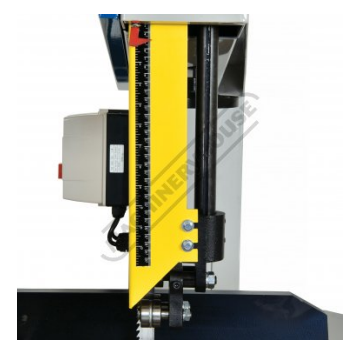
Blade Height Indictaor