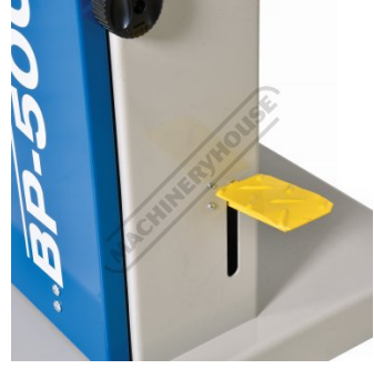
Foot Brake Lever