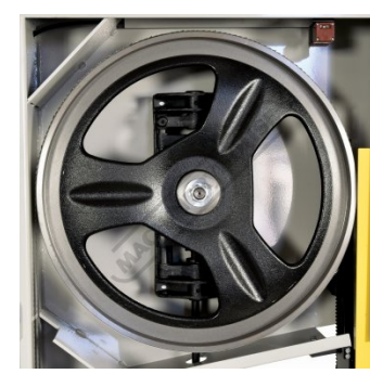
Heavy Duty Cast Iron Wheel