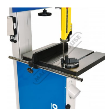
Table With Sliding Fence