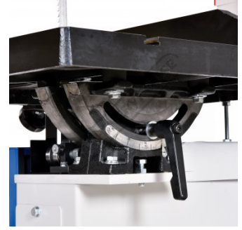
Table Tilt Adjustment