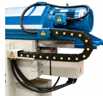
Motor And Track