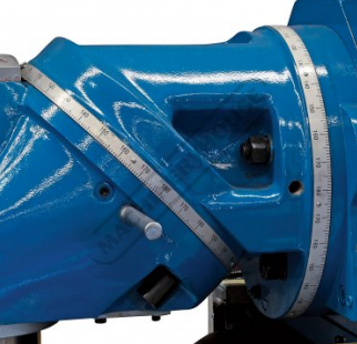
Head Tilts Vertical To Horizontal