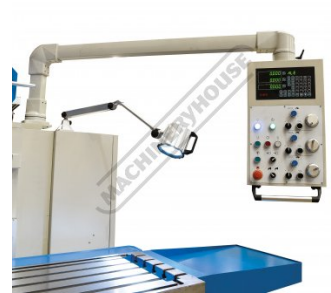
Adjustable Control Arm