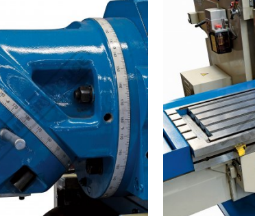
Large Slotted Work Table