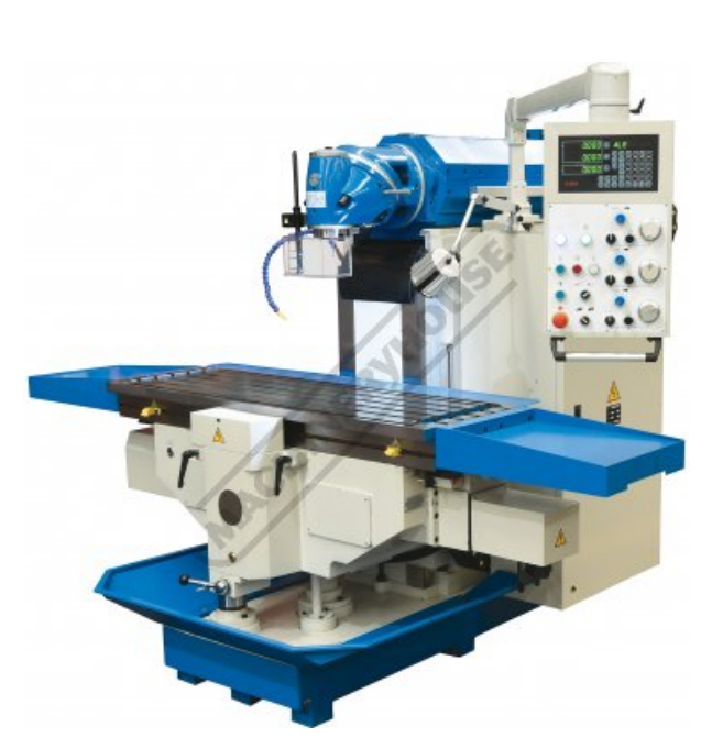
Table Travel: (X) - 1400mm (Y) - 700mm (Z) - 500mm Includes Digital Readout System & Servo Driven Ballscrew System X, Y & Z-Axis