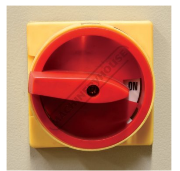
ON OFF Switch