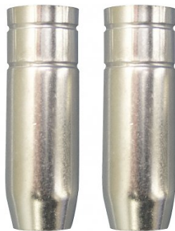
W535 2 x Conical Nozzles