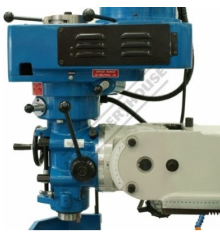
Head Right Side View