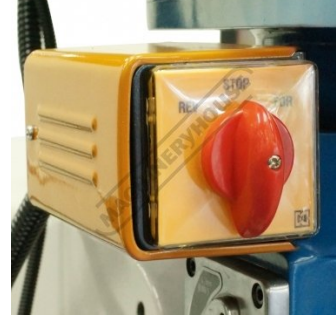
Spindle Foward Reverse Switch