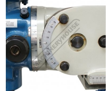
Universal Tilting and Rotating Head Adjustable Swivel & Sliding Ram