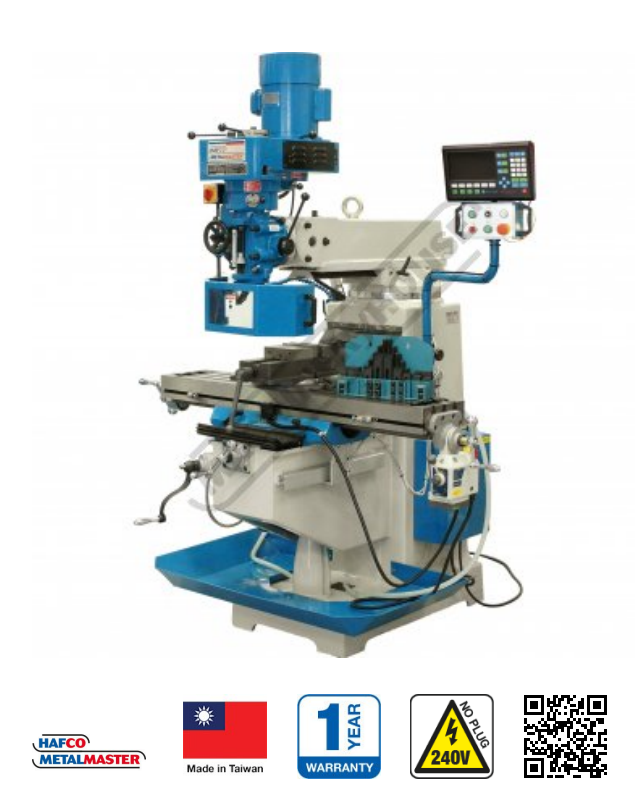
Table Travel: (X) - 760mm (Y) - 360mm (Z) - 430mm Includes Digital Readout System, Vice & Clamp Kit