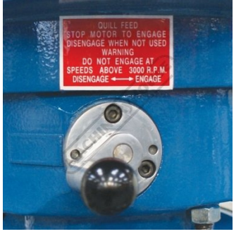
Feed Engage Disengage Drive