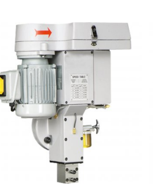
M225 Precision Slotting Head Attachment