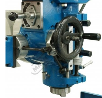
Quill Feed Engagement Lever