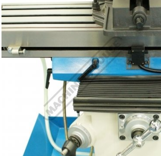
Table Feed Limit Switches