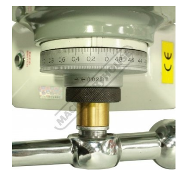
X Axis Dial