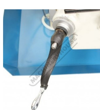
Knee Feed Handle