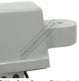
Tail Lug Spigot Supports Slotting Head