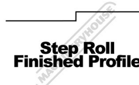
Step Roll Finished Profile