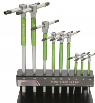
H822 Torx® Key Set with T-Bar Handle