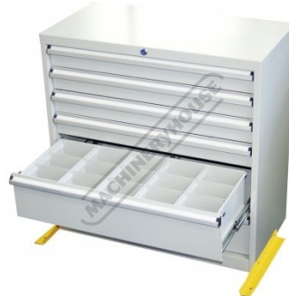
200mm Drawers with Steel Dividers