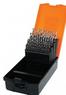
D1285 Metric Precision HSS Drill Set - 51 Piece