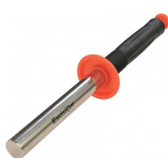
L300 Magnetic Swarf Remover