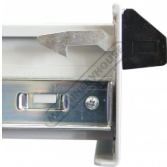
Concealed Safety Hook