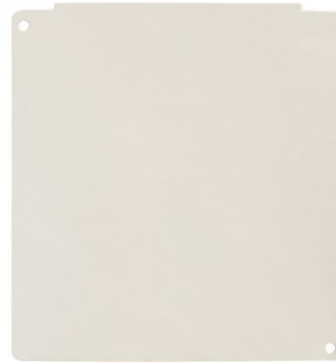
T788 Steel Divider