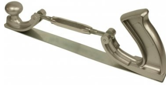
F155 Flexible Body File