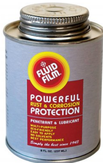
O043 Rust & Corrosion Preventive - Penetrant & Lubrication