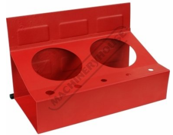
T703 Magnetic Spray Can & Screwdriver Holder