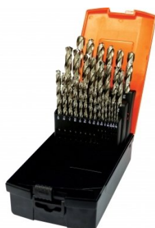
D1282 Imperial Precision HSS Drill Set - 29 Piece