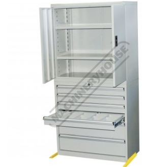
Shown with Optional (T774) Storage Cabinet Optional