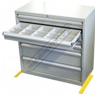
100mm Drawer with Steel Dividers