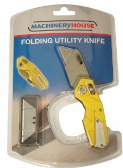
08048 Folding Utility Knife