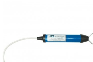
G070 Grease Gun