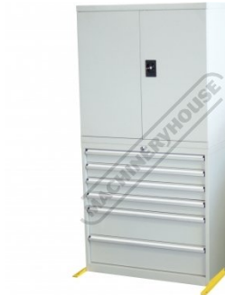
Shown with Optional (T774) Storage Cabinet Optional