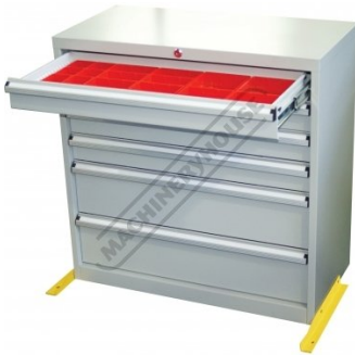
Top Drawer with Plastic Buckets