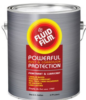
O044 Rust & Corrosion Preventive - Penetrant & Lubrication