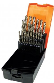
D1272 Metric Precision HSS Drill Set - 25 Piece