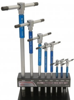
H820 Metric Hex Key Set with T-Bar Handle