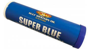
G057 Super Blue Complex Grease Cartridge