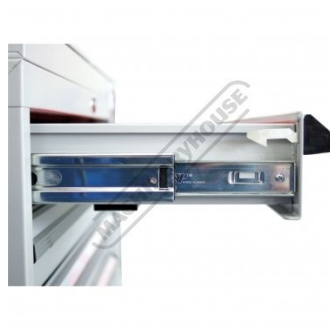
Ball Bearing Slides