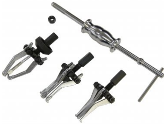
P013 Puller Set with Slide Hammer