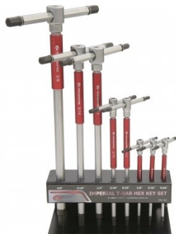
H821 Imperial Hex Key Set with T-Bar Handle