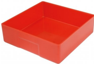
A429 Plastic Bucket