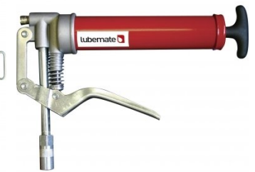
G070 Grease Gun